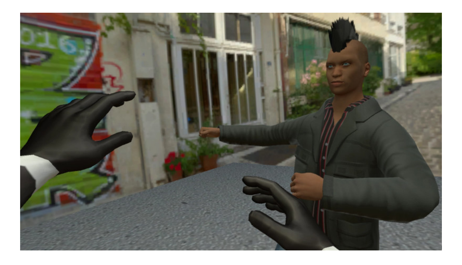
Download ->>> <a href="http://bit.ly/2SIojmY">http://bit.ly/2SIojmY</a>